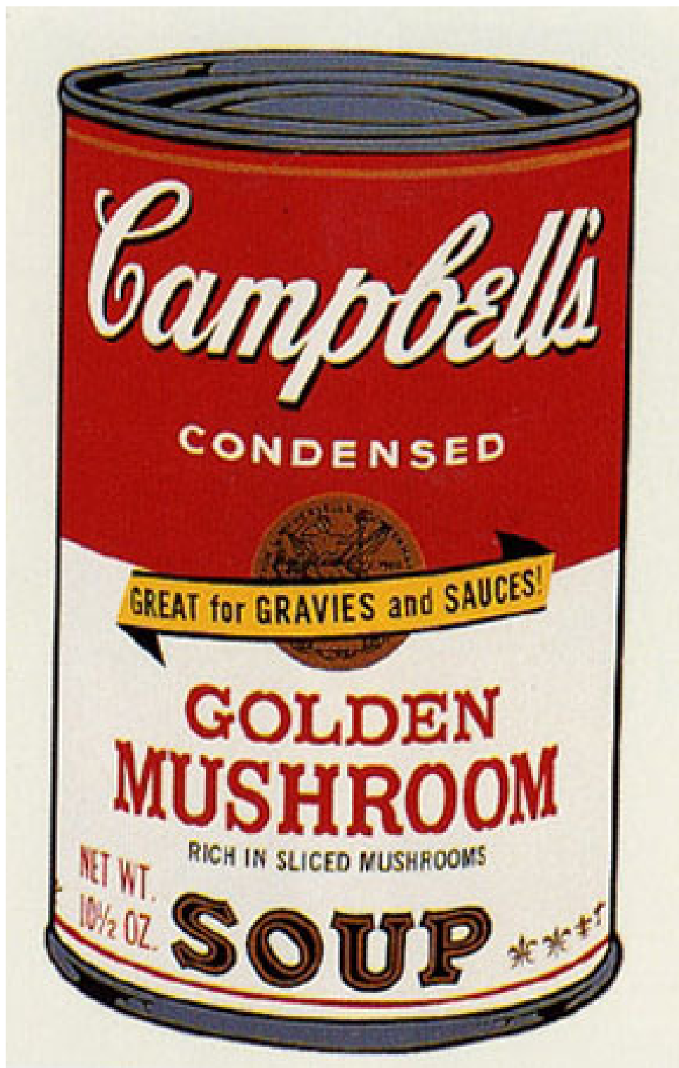
Screenprint on paper, 88,9 x 58,4 cm, Edition 63/250, signed and numbered on verso