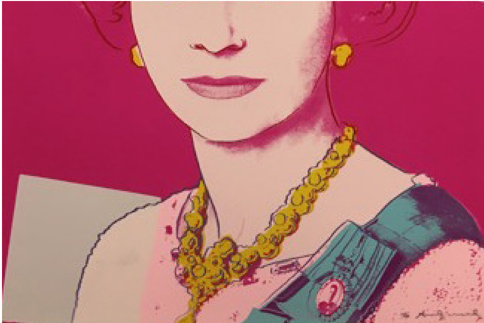
Screenprint on lenox museum board, 100 x 80 cm, 112 x 91 cm (framed), Edition 15/40, signed and numbered with pencil in lower right

Queen Elizabeth II of the United Kingdom, 1985