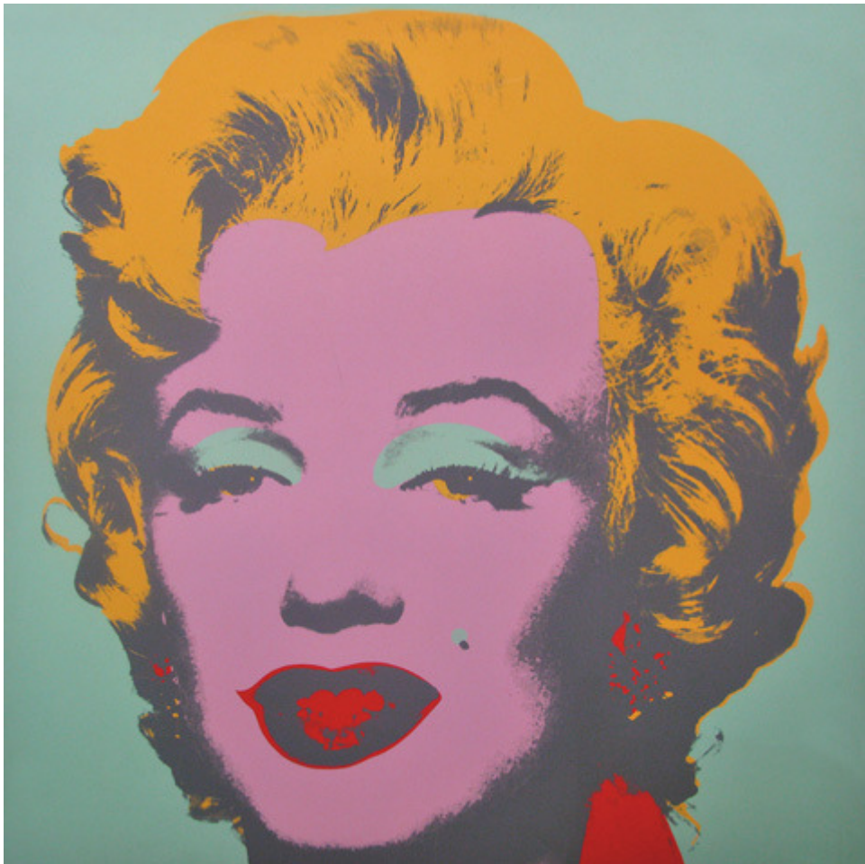
Screenprint on vellum board, 91,4 x 91,4 cm, Edition 184/250, verso lower left hand signed and numbered lower right

Andy Warhol started working on the imagery of Marilyn Monroe after her tragic death in 1967. He produced what would become one of the most iconic and memorable representations of the actress, and consequently one of the most sought after printed editions of his work. Warhol created a series of 10 variations in what is now referred to as the Marilyn Series, each with virtually the same