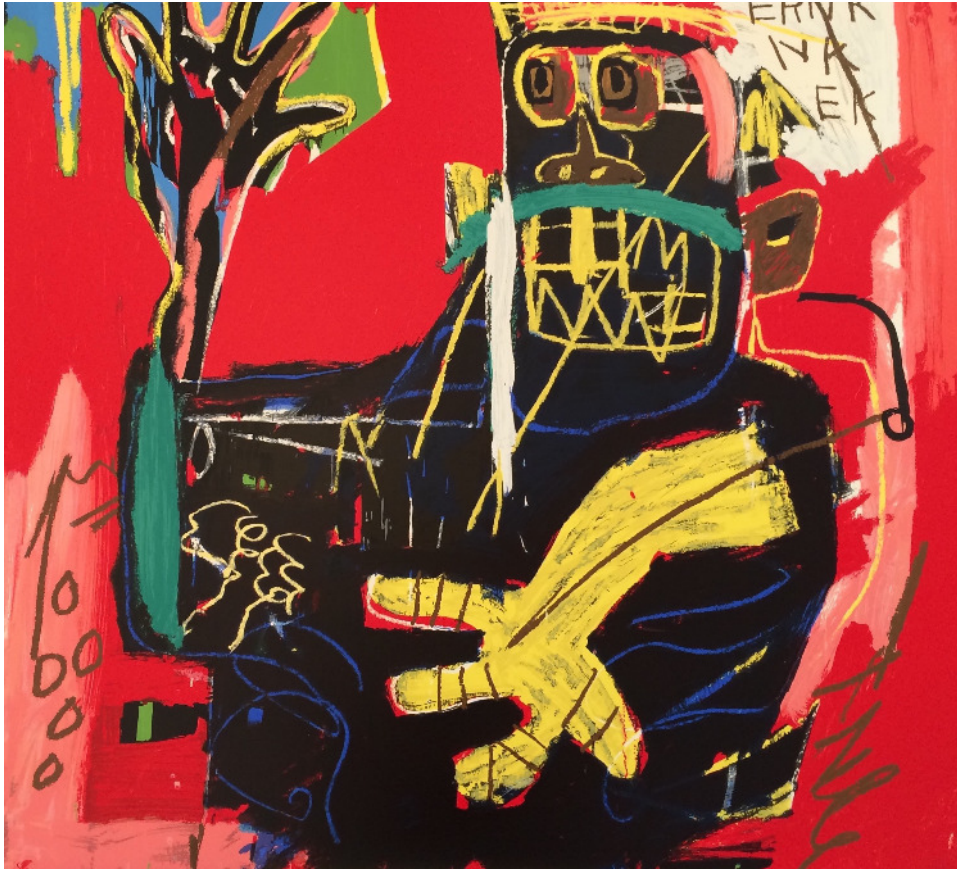
Screenprint, 101,6 x 101,6 cm, 117 x 117 x 5 cm (framed), Edition 11/85, signed and stamped by Basquiat estate on verso

Jean Michel Basquiat (22.12.1960 – 12.8.1988) was one of the most important American artists of the 20th century. He first achieved notoriety as part of SAMO, an informal graffiti duo who wrote enigmatic epigrams in the cultural hotbed of the Lower East Side of Manhattan during the late 1970s where the hip hop, post-punk, and street art movements had coalesced. By the 1980s, he was exhibiting his neo-expressionist paintings in galleries and museums internationally. The Whitney Museum of American Art held a retrospective of his art in 1992.