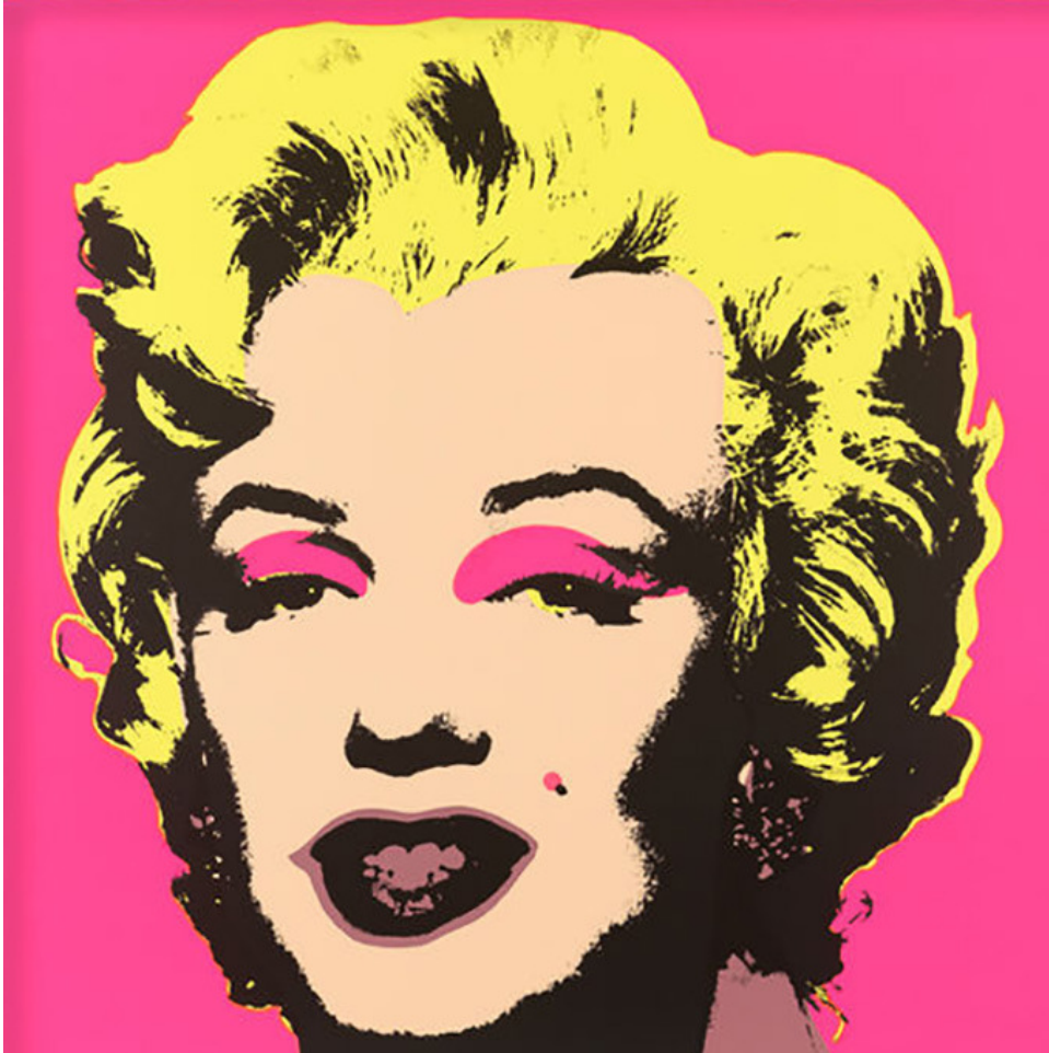
Screenprint on lenox museum board, 91,4 x 91,4 cm, Edition 94/250, black rubber stamp on verso: numbering and published by Sunday B. Morning

composition, but different color variations. There were only 250 portfolios made in total.