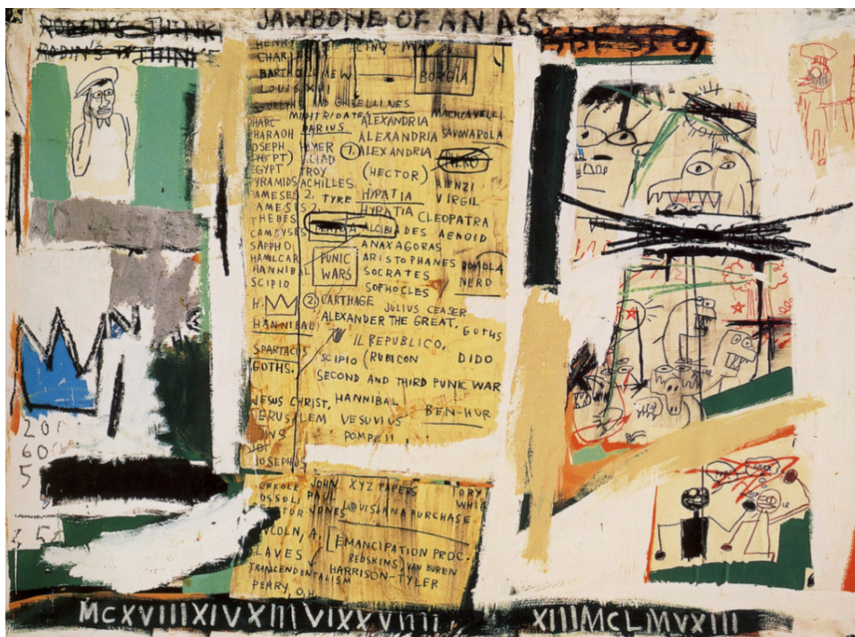
Screenprint, 155 x 105,4 cm, 193 x 147 x 12 cm (framed), Edition 74/85, signed on the stamped certificate of authenticity by the executor of the estate on verso