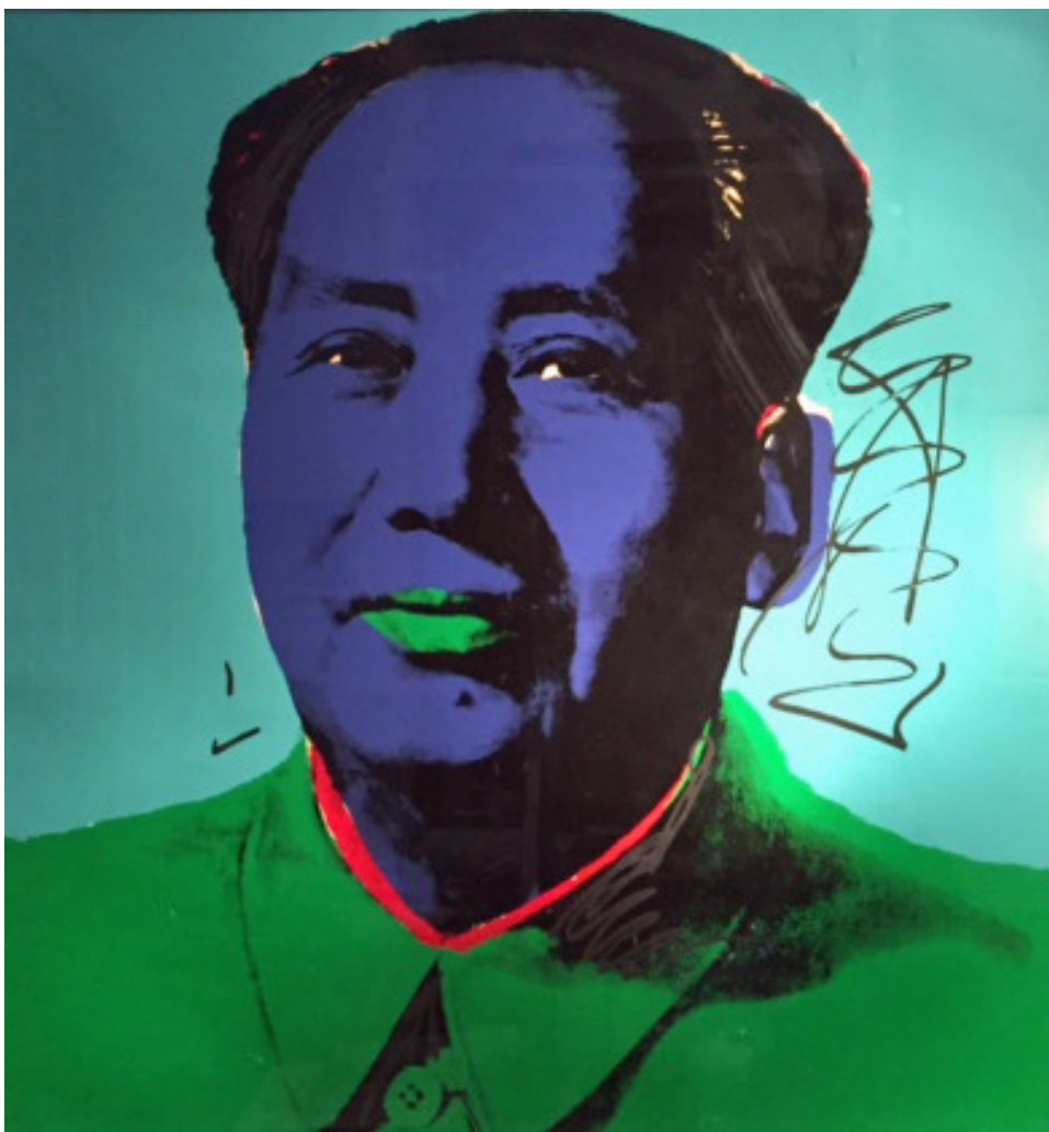
Silkscreen on Beckett High White Paper, 91,4 x 91,4 cm, 127 x 127 x 8 cm (framed), unique character, stamped on verso