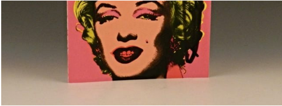
Lithograph on paper, 17,7 x 17,7 cm, 33 x 33 x 4 cm (framed), Edition ca. 250, signed on front