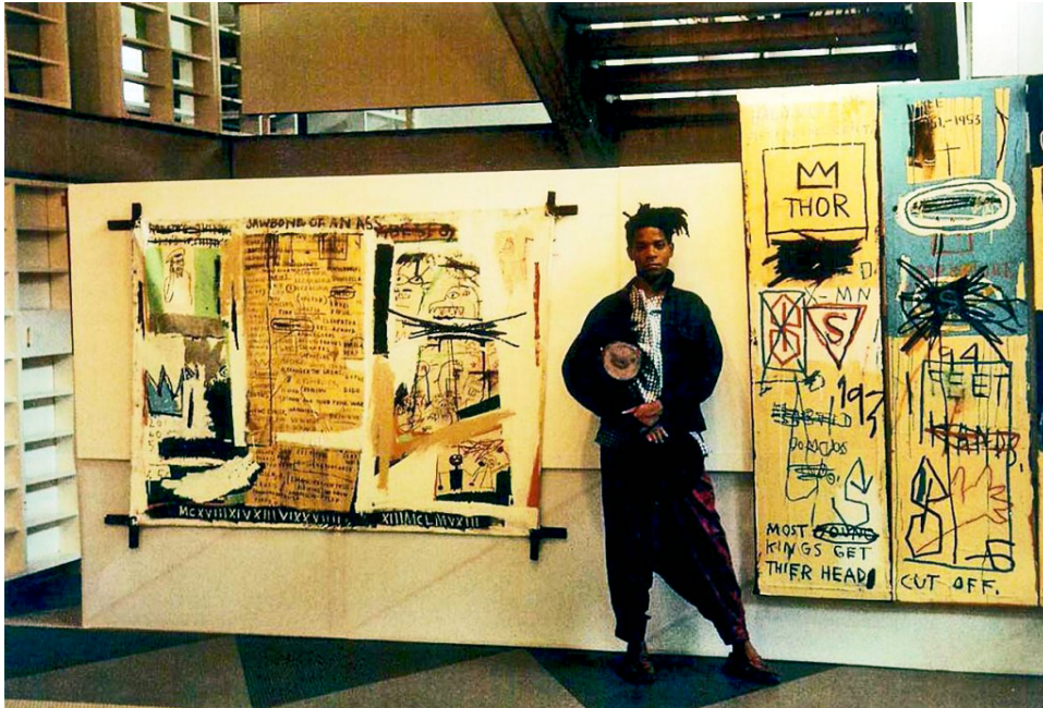
Jean-Michel Basquiat Jawbone of an Ass, 1982/2005